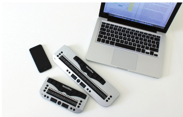
Interactive connection with five devices at the same time.

In addition to being the most connectable braille device you can find, VarioUltra is also a powerful braille notetaker with a suite of productivity apps to make life easier. Some examples include a word processor, spreadsheet and PDF viewers, and a calculator.